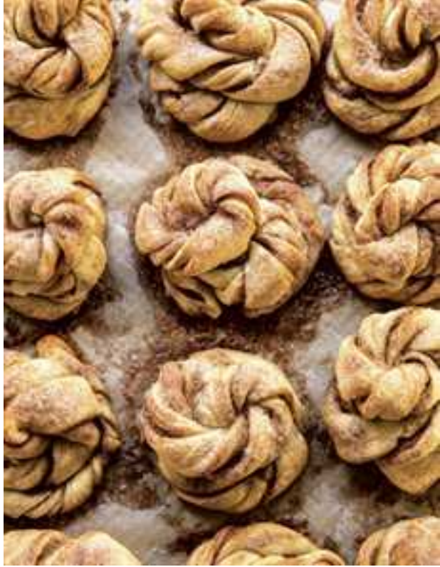
Cinnamon Sugar Knots, this page