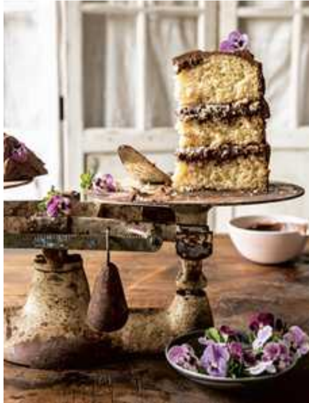
Coconut Cake with Chocolate Frosting, this page

To make this book as easy and fun to use as possible, I included some icons to help you navigate what's here. Look for the following categories throughout the book so you can see what a recipe has to offer at a glance: