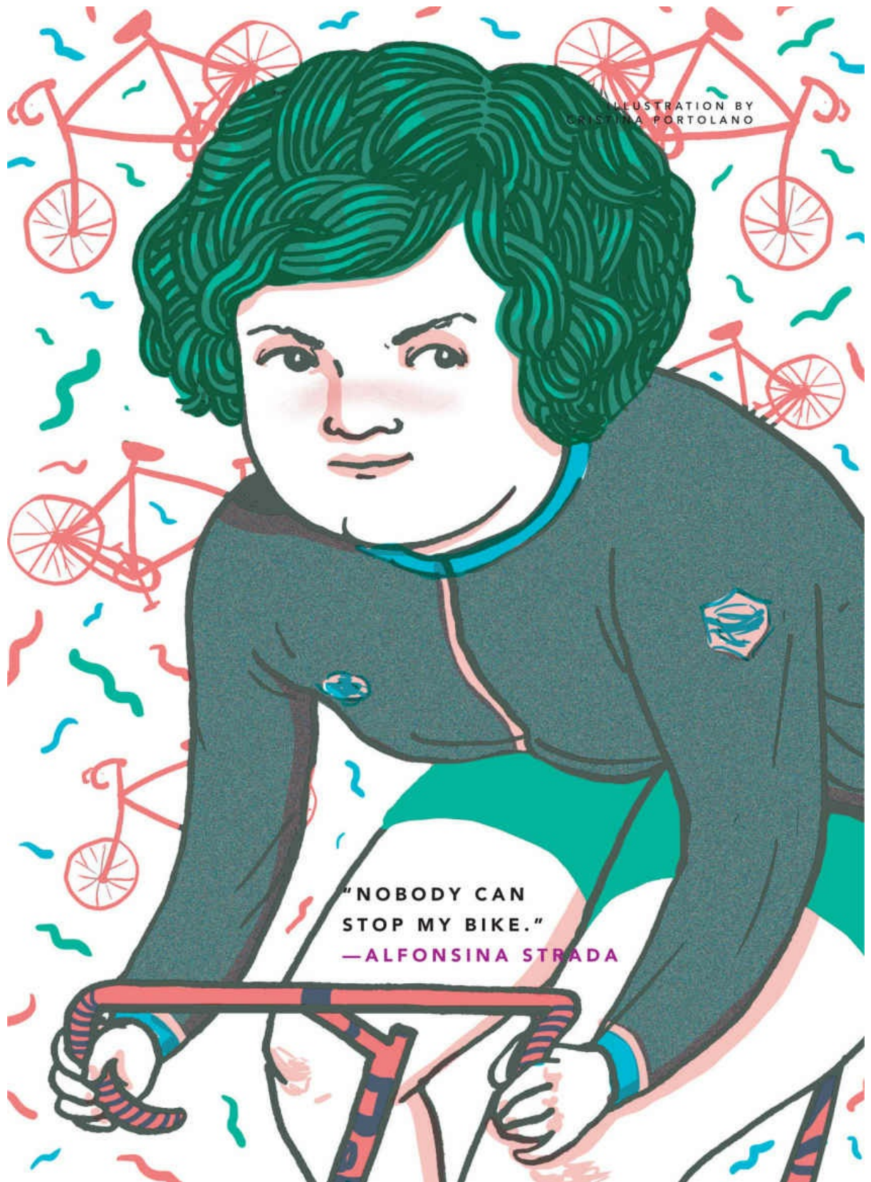
ILLUSTRATION BY CRISTINA PORTOLANO

"NOBODY CAN STOP MY BIKE." —ALFONSINA STRADA