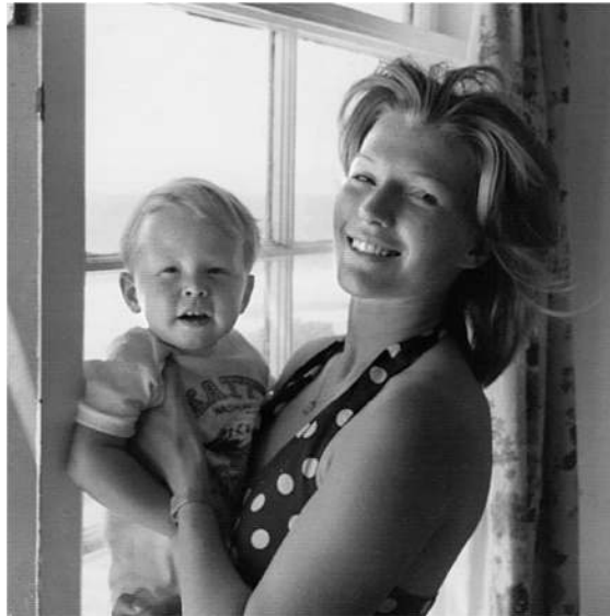
Elon and Maye Musk